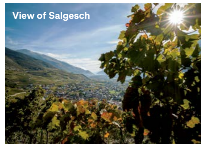
View of Salgesch