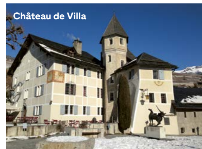
Château de Villa