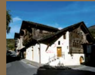
Wine Museum – Salgesch