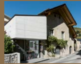
Wine Museum – Sierre

Nestled in the heart of the Valais region, the Wine Museum encompasses a wine trail as well as two exhibition sites: one within the confines of the Château de Villa, the other one in the wine village of Salgesch. The Wine Museum - Sierre features temporary thematic exhibits. Discover the millennia old mountain wine culture through its local wines at the permanent exhibition in Salgesch. The museum offers a rich calendar of events as well as specific cultural activities.