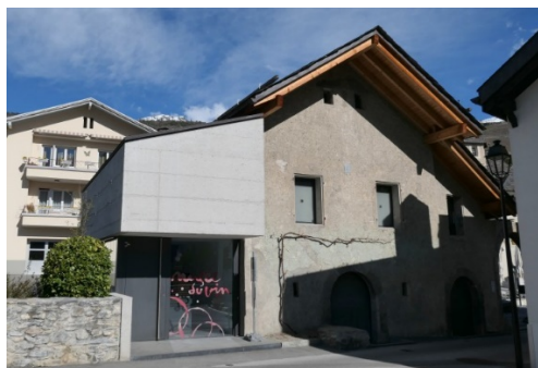
Musée du Vin – Sierre , Rue Ste-Catherine 6, 3960 Sierre, +41 (0)27 456 35 25, contact@museedevin-valais.ch

After your visit to the Château du Villa, you will conveniently find the Sierre location of the Musée du Vin next door. This space is home to the museum's temporary expositions. While we were there, we explored La voix du vin ( The voice of wine ), which focuses on the many sounds associated with wine-making. This exposition continues until November 30, 2018. When you purchase your ticket at the museum in Sierre, keep it on hand so you can present it at the museum's other location in Salgesch.