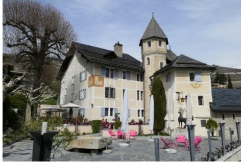
Château de Villa , Rue de Ste-Catherine 4, 3960 Sierre, +41 (0)27 455 18 96, info@chateaudevilla.ch

From the main train station in Sierre (Siders in German), it takes about 15 minutes to walk up to the Château de Villa , which I recommend as the first stop on your walk. The Cœnothèque at this castle includes more than 650 different kinds of wines from over 110 producers in Valais. You can sample these wines and other local dishes at the wine bar or have some raclette cheese for lunch at the restaurant. During our visit, I tried two wines made with ancient grape varieties from this region of Switzerland: Amigne and Humagne blanc.